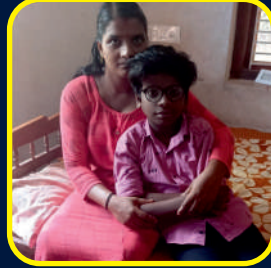
Fidal Dev 12 Years Heart Disease