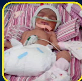
B/O Fauzia 2 Months Premature Birth Complications