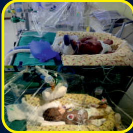
Twins of Dhivya 1 Month, 6 Days Premature Birth Complication