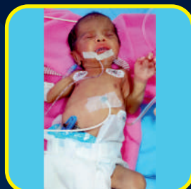
B/O Mohd. Nawaz Twins 7 Days Old Premature Birth Complication