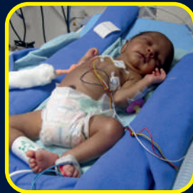
Baby of Laya 3 days Respiratory Distress