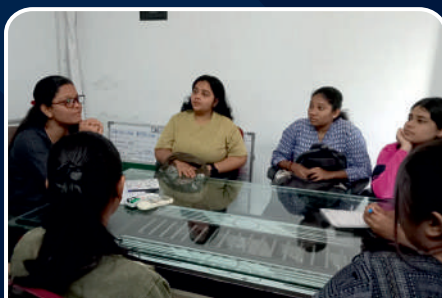
R. D. National & W. A. Science College