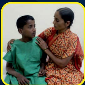
Sayabana 14 years Spinal Deformity