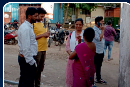
Visit to Aarey Colony