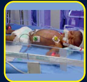
Baby of Janagam 1 day Respiratory Distress