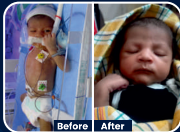
Baby of Janagam