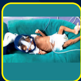
Babies of Pavithra