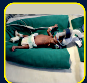
Baby of Sivagami