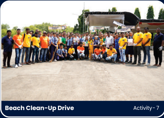
Beach Clean-Up Drive