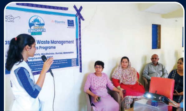
Dry Waste and Wet Waste Segregation and Management - Awareness Session

On 28th September, 2022, our project team conducted an awareness Session on Waste Management and Segregation in Antariksha Society, Kashimira, Mumbai, Maharashtra. Information about dry waste, wet waste, sanitary waste, and hazardous waste was given to the participants through power point presentation.