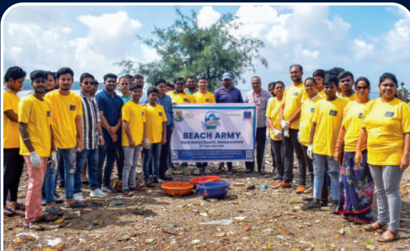
Beach Clean-Up Drive

The volunteers of the Child Help Foundation had participated in the Indian Swachh Bharat League. With the spirit of creating garbage-free cities to enable all our citizens to live in a clean environment, our team took part in various activities along with other groups of activists. They registered their participation in activities like beach clean-up drives and special cleanliness campaigns at gardens and other heritage structures in the twin cities.