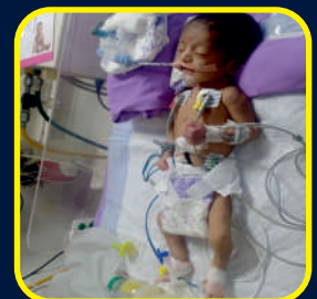
Baby of Swetha (1 month) Septic Shock