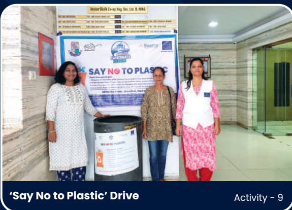
'Say No to Plastic' Drive