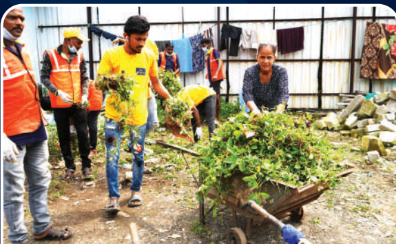
Swachhta Abhiyan - Model Community