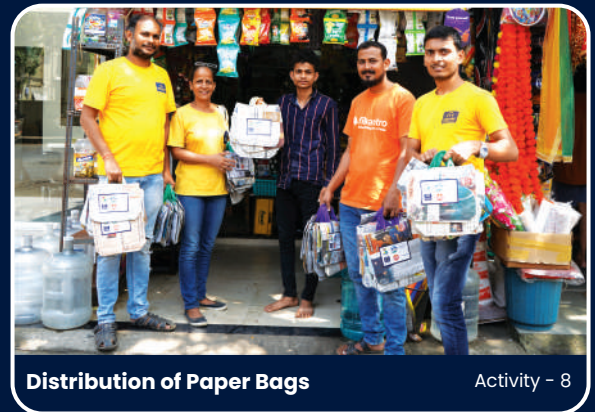
Distribution of Paper Bags

The team of Child Help Foundation distributed paper bags made from old newspapers to small shop vendors in the area of Jangid Estate, Mira Road, Maharashtra. These bags made by the students of MBMC School promoted awareness about using paper bags instead of single use plastic bags.