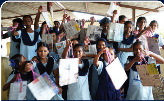
Paper Bag Activity