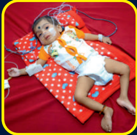
Baby of Mounika (9 months) Spinal Infection