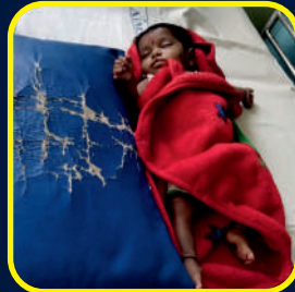
Sonakshi (9 months) Heart Defect