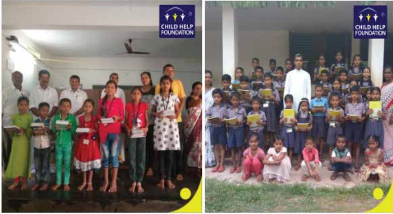
Stationary and Uniforms distributed to students of St.Victors School at Baj agoli ,Mangalore