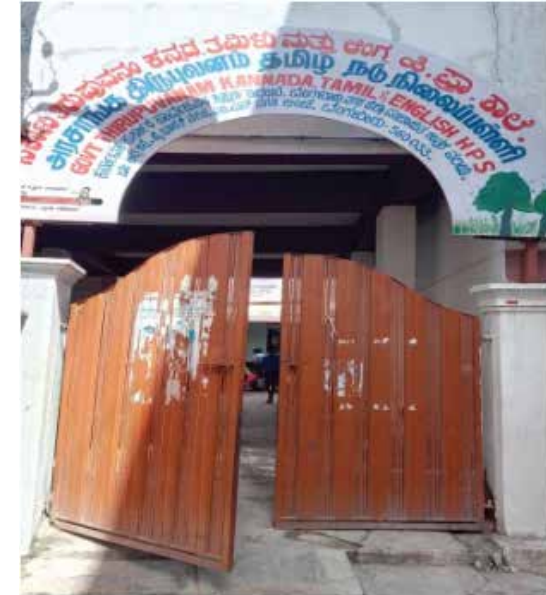
School painting Initiative