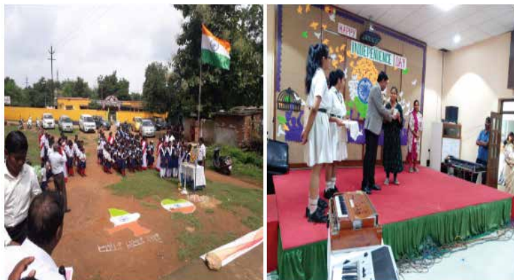
Independence Day celebrations in Koel Saraswati Shishu Mandir, Rourkela and Delhi Public School, Durgapur