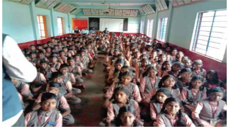
Cancer Awareness Programme in Kendriya Vidyalaya Schools –Chennai SFR team covered more than 75 schools and got permission to conduct cancer Awareness Programme in another 40 schools.